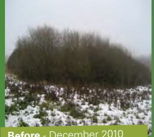
Before - December 2010