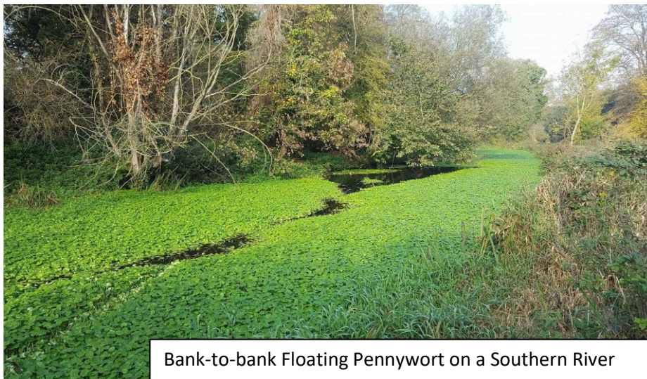
Bank-to-bank Floating Pennywort on a Southern River