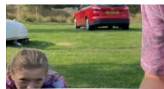
L2 AELC Jacksdale 1284

You'll need to quote the name and/or start date of the course that you want to join (for example L2 Birmingham C starting 2nd July, or L1 AT Online AP starting 16th August).