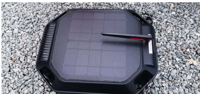
A WATR in-situ water quality monitoring unit

Fishery staff should be visiting waters to check dissolved oxygen (DO) levels regularly, throughout the day if possible. If this isn't feasible then aim to visit the water at dawn, when oxygen levels are at their lowest, so that you can act if needed. If it is difficult to visit the fishery on a regular basis you may want to consider an in-situ DO monitoring system. These record oxygen levels continuously and are really useful for alerting managers to DO issues. Some systems send the recordings directly to a phone or email and can even activate aeration should a trigger level be met